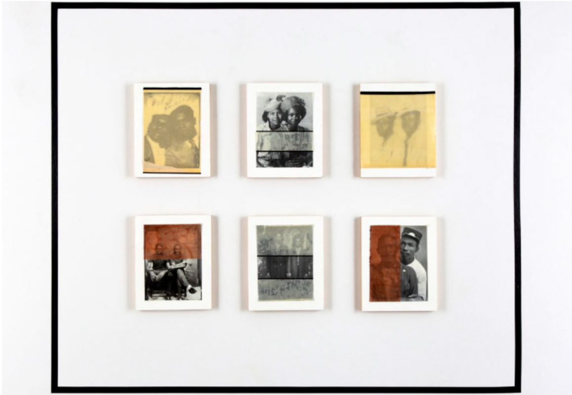
Alanna Fields, Past Tense Future Present , 2019, from the series As We

these deep blacks and browns, that I feel create their own story alongside the photographs and bring more memory into them.