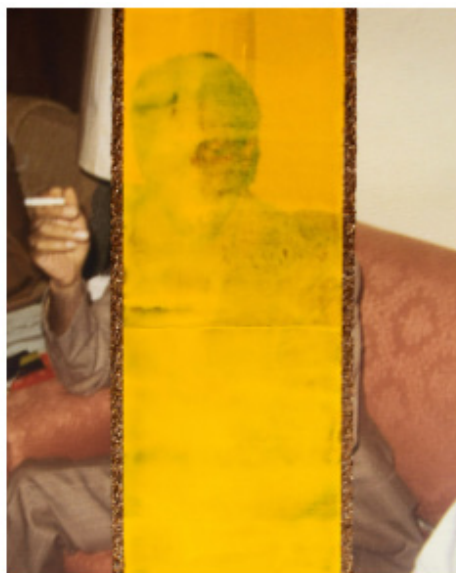
Alanna Fields, Still Ain't Studdin You , 2019, from the series Audacity

Acheampong: In your artist statement for Audacity , you write about “looking closely at embodiments of masculinity and femininity through aesthetic posture and gesture.” How do you decide which gestures to make your centerpieces? I saw a lot of hands; I saw a lot of body parts that maybe aren’t the most obvious ones people think of when thinking through sexuality or sexual expression.