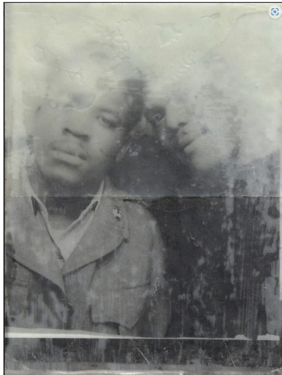
Alanna Fields, Untitled II , 2019, from the series As We Were

On the symbolism of wax, early uses of encaustics were to preserve paintings through the application of thin layers. Along with the potential to see and not see with the wax, I really love the fact that it seals the memory, it holds the memory, it holds the photograph together.