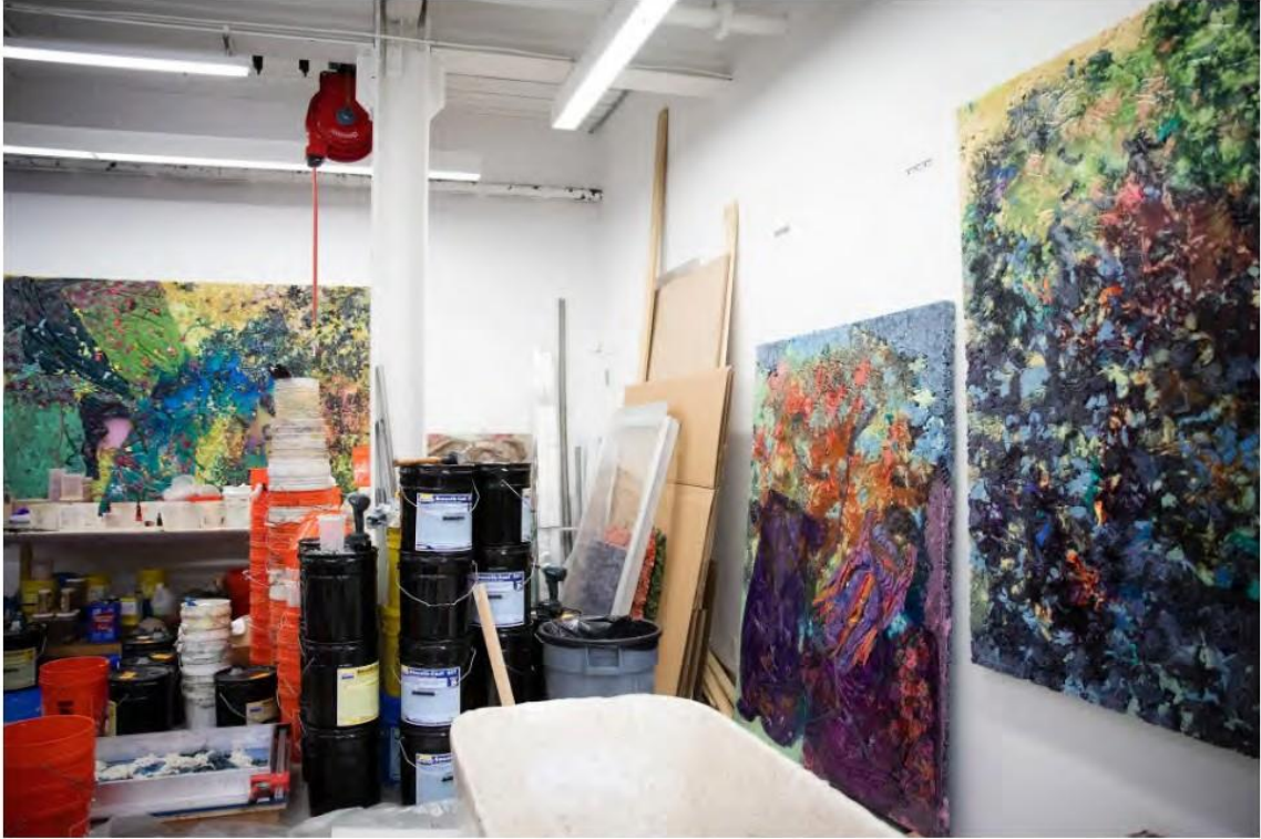
Recent sculptural wall hangings, or slabs, as Beasley calls them, surrounded by the materials of their making. Aundre Larrow