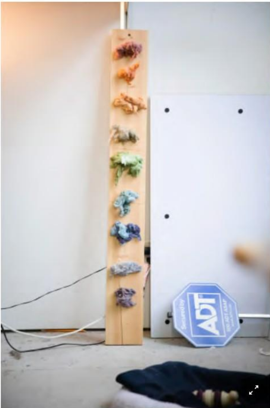
Bundles of dyed cotton soaked in resin are fixed to a wooden plank for color reference. Aundre Larrow