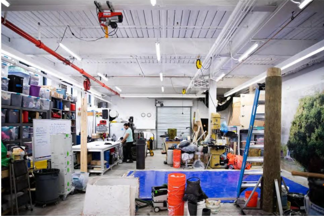
A glimpse of tools and techniques. Aundra Larrow