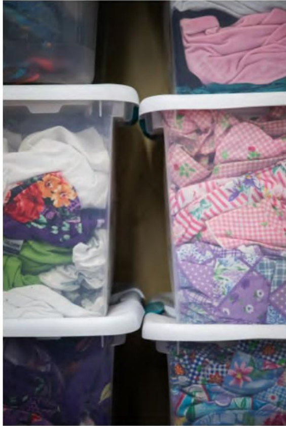
Plastic bins filled with patterned housedresses. Aundre Larrow