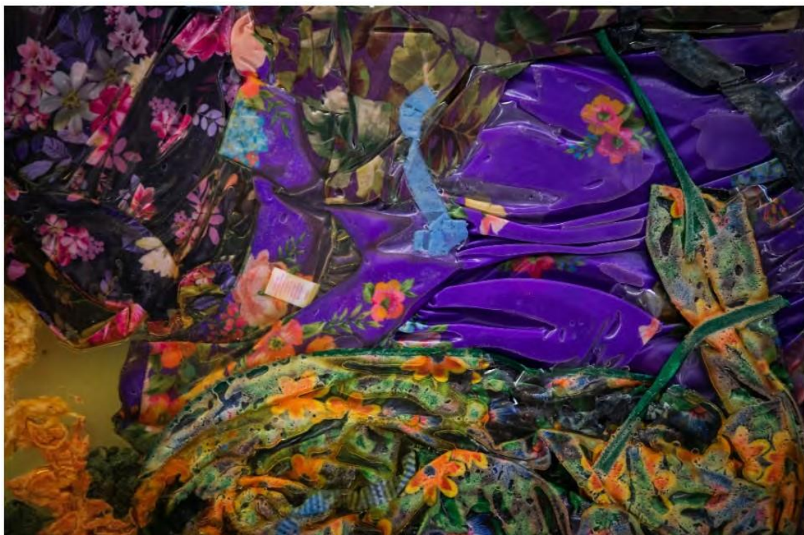
Floral patterned housedresses embedded within a plane of resin. Aundre Larrow

No, I used to have like 10 pairs of those when I was a kid, one in every colorway. You can go on the Nike website and customize them all. That shoe is never going away. It's like a cockroach — it's going to be here forever.