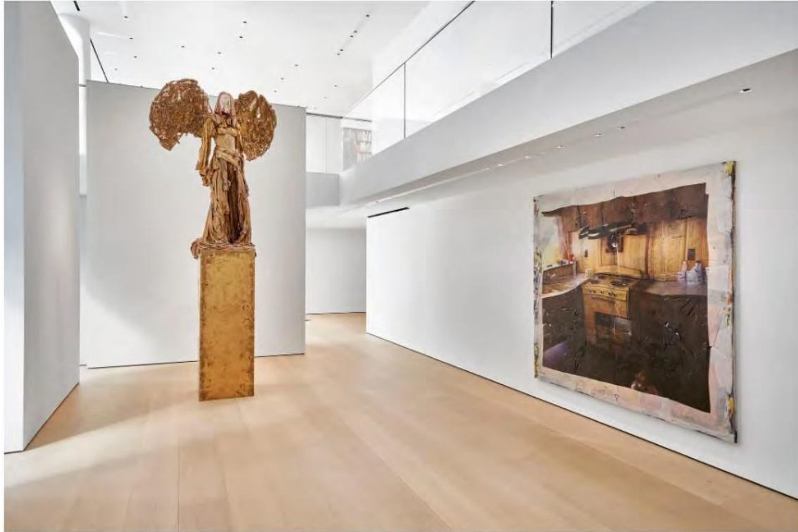
From left: Beasley's "Bird" (2022) and "THE KITCHEN" (2021) at his current show at the Hill Art Foundation in New York City.

In 2018, "A view of a landscape," a watershed solo exhibition for the artist, opened at the Whitney Museum of American Art in New York. In the central installation, a vintage cotton gin motor that Beasley bought in Alabama whirred within a giant vitrine. But just as the engine was designed to separate seeds from cotton, Beasley severed the machine from the sound it made, piping it into another room, where the workhorse's droning was so loud it rattled the benches intended for visitors, and anyone who sat on them. It was a history lesson, felt in the bones — and perhaps a reminder that the gin's original effect was also unexpected: Eli Whitney hoped the invention would end slavery; in fact, it strengthened the institution.