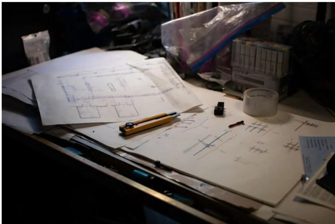
Sketches and plans for forthcoming sculptures and exhibitions. Aundre Larrow