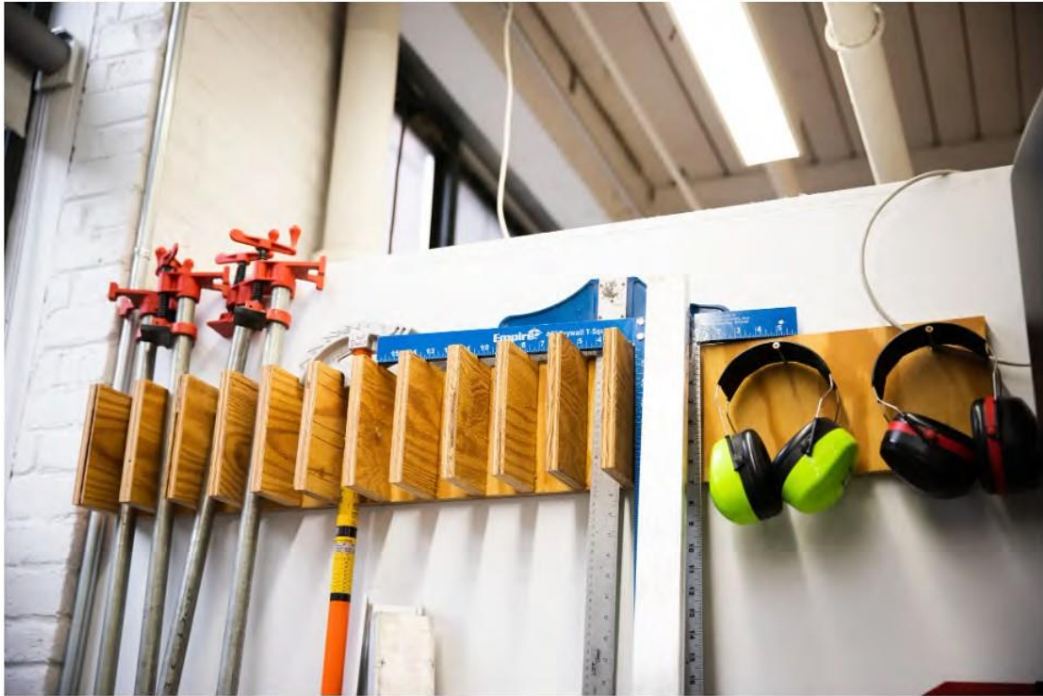
Racks to help keep things organized. Aundre Larrow

We've all had jobs where we've worked with people who were complete jerks. You learn how people can be cruel, how labor isn't valued. But there are other things we can learn that cultivate love and sharing and sensitivity and awareness, and that echoes in everything you do. I only want this many studio assistants. The pros and cons of that are you have a small group with whom you have a close, intimate relationship in terms of how you communicate — we are kind and treat each other with a lot of respect — but then there's also a lot of pressure with a small team.