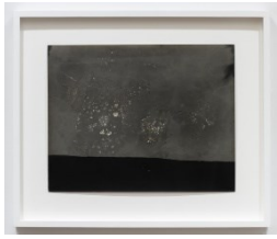
Alison Rossiter (American, b. 1953) Canadian Kodak Limited, P.M.C. No.6, expired February 1st, 1922, processed 2019 (2), 2025

Gelatin Silver Print 11" x 14" (28 x 35.5 cm) Framed: 16 1/6" x 19 1/16" (41 x 48 cm) Unique (AR.25556)