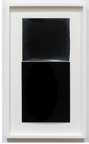
Alison Rossiter (American, b. 1953) Guillemot-Boespflug & Cie, Etoile, ca.1930s / Gevaert Gevaluxe Velours, ca.1930s, 2025

Two Gelatin Silver Prints Overall: approximately 17" x 15" (43 x 38 cm) Framed: 18 1/4" x 11 3/8" (46 x 29 cm) Unique (AR.25568)