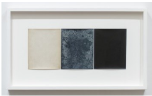
Alison Rossiter (American, b. 1953) 20th Century Photo Company, Ltd., Platino Matt, manufactured ca. 1920s, processed 2023, 2025

Four Gelatin Silver Prints 5" x 4" (12.5 x 10 cm), each element Framed: 15 1/8" x 13 1/8" (38.5 x 33.5 cm) Unique (AR.23696)