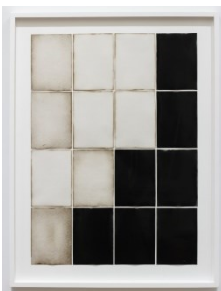
Alison Rossiter (American, b. 1953) Semblance, Man Ray Tapestry, 2024 Sixteen Gelatin Silver Prints 7" x 5" (18 x 13 cm), each element Framed: 33 3/8" x 25 5/8" (85 x 65 cm) Unique (AR.25580)