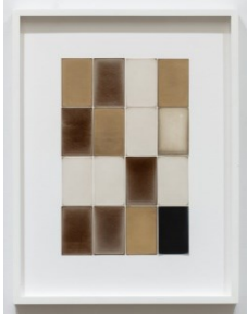
Alison Rossiter (American, b. 1953) Semblance, Man Ray Tapestry (2), 2025 Sixteen Gelatin Silver Prints 2 1/2" x 1 3/4" (6.5 x 4.5 cm), each element Framed: 16 9/16" x 12 9/16" (42 x 32 cm) Unique (AR.25467)