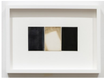
Alison Rossiter (American, b. 1953) Darko (Sears Roebuck & Co.), expired June 1st, 1936, processed 2023, 2025 Three Gelatin Silver Prints 2 3/4" x 1 3/4" (7 x 4.5 cm), each element Framed: 7 11/16" x 10 11/16" (19.5 x 27 cm) Unique (AR.25585)