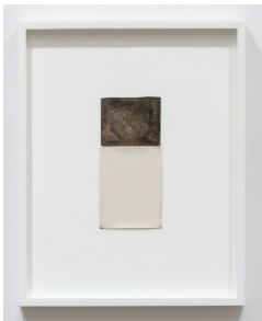
Alison Rossiter (American, b. 1953) Daguerre, Baekeland, 19th century (2), 2024 Daguerreotype Plate and Gelatin Silver Print Overall: approximately 8" x 4" (20 x 10 cm) Framed: 14 15/16" x 11 15/16" (38 x 30 cm) Unique (AR.25575)