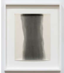
Alison Rossiter (American, b. 1953) Gevaert, Novaflex Contact Paper, ca. 1950s, processed 2024 (1), 2024

Three Gelatin Silver Prints 5" x 4" (13 x 10 cm), each element Framed: 9 15/16" x 16 15/16" (25.5 x 43 cm) Unique (AR.25586)