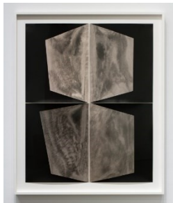
Alison Rossiter (American, b. 1953) Eastman Kodak, Polycontrast F, expired September 1977, processed 2017, 2025

Five Gelatin Silver Prints Framed: 15 7/8" x 21 7/8" (40.5 x 55.5 cm) Unique (AR.23042)