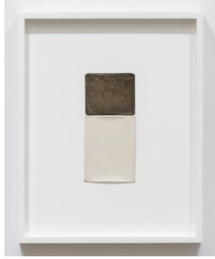
Alison Rossiter (American, b. 1953) Daguerre, Baekeland, 19th century (1), 2024 Daguerreotype Plate and Gelatin Silver Print Overall: approximately 8" x 4" (20 x 10 cm) Framed: 14 15/16" x 11 15/16" (38 x 30 cm) Unique (AR.25574)