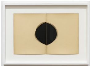
Alison Rossiter (American, b. 1953) Eastman Kodak, Portrait Bromide, expired June 1st, 1937, processed 2025, 2025 Two Gelatin Silver Prints 10" x 8" (25.5 x 20.5 cm), each element Framed: 15" x 21 1/8" (38 x 53.5 cm) Unique (AR.25591)