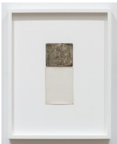
Alison Rossiter (American, b. 1953) Daguerre, Baekeland, 19th century (5), 2024 Daguerreotype Plate and Gelatin Silver Print Overall: approximately 8" x 4" (20 x 10 cm) Framed: 14 15/16" x 11 15/16" (38 x 30 cm) Unique (AR.25578)