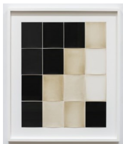
Alison Rossiter (American, b. 1953) Semblance, Man Ray Tapestry, 2025 Sixteen Gelatin Silver Prints 5" x 4" (13 x 10 cm), each element Framed: 25 5/16" x 21 3/8" (64 x 54 cm) Unique (AR.25582)