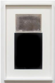
Alison Rossiter (American, b. 1953) Imperial P.O.P. mauve, ca. 1910s / Ansco, Cyko, expired July 1st 1912, processed 2017, 2025

Two Gelatin Silver Prints Overall: approximately 13 3/8" x 6 1/2" (33.5 x 16.5 cm) Framed: 18 1/4" x 11 3/8" (46 x 29 cm) Unique (AR.25571)