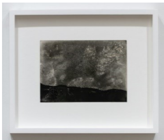
Alison Rossiter (American, b. 1953) Eastman Kodak Azo, expired April 1st, 1921, processed 2025 (2), 2025 Gelatin Silver Print 5" x 7" (13 x 18 cm) Framed: 9 15/16" x 11 15/16" (25 x 30 cm) Unique (AR.25560)