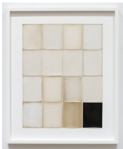
Alison Rossiter (American, b. 1953) Semblance, Man Ray Tapestry, 2025 Sixteen Gelatin Silver Prints 4 1/4" x 3 1/4" (11 x 8 cm), each element Framed: 22 3/8" x 18 3/8" (57 x 47 cm) Unique (AR.25581)