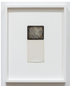
Alison Rossiter (American, b. 1953) Daguerre, Baekeland, 19th century (6), 2024 Daguerreotype Plate and Gelatin Silver Print Overall: approximately 8" x 4" (20 x 10 cm) Framed: 14 15/16" x 11 15/16" (38 x 30 cm) Unique (AR.25579)