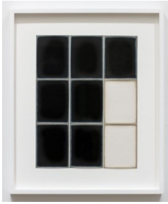
Alison Rossiter (American, b. 1953) Wellington & Ward, S.C.P., manufactured ca. 1910s, processed 2023, 2025 Nine Gelatin Silver Prints 4 1/4" x 3 1/4" (11 x 8 cm), each element Framed: 17 3/4" x 14 13/16" (45 x 35 cm) Unique (AR.25593)