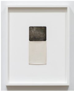
Alison Rossiter (American, b. 1953) Daguerre, Baekeland, 19th century (3), 2024 Daguerreotype Plate and Gelatin Silver Print Overall: approximately 8" x 4" (20 x 10 cm) Framed: 14 15/16" x 11 15/16" (38 x 30 cm) Unique (AR.25576)