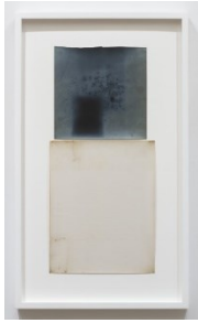
Alison Rossiter (American, b. 1953) Guillemot-Boespflug & Cie, Etoile, ca.1930s / Gevaert Larjex, ca.1950s, 2025

Two Gelatin Silver Prints Overall: approximately 17" x 15" (43 x 38 cm) Framed: 18 1/4" x 11 3/8" (46 x 29 cm) Unique (AR.25568)