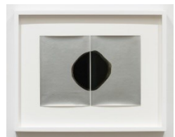
Alison Rossiter (American, b. 1953) Silvered Darko (Sears Roebuck & Company), exact expiration date unknown ca. 1900s, processed 2016, 2025

Four Gelatin Silver Prints 20" x 16" (51 x 40.5 cm), each element Framed: 45 1/2" x 37 5/8" (116 x 96 cm) Unique (AR.25447)