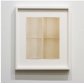
Alison Rossiter (American, b. 1953) Eastman Kodak, Velox, expired 1912, processed 2021, 2023

Gelatin Silver Print 11" x 14" (28 x 35.5 cm) Framed: 16 1/6" x 19 1/16" (41 x 48 cm) Unique (AR.25556)