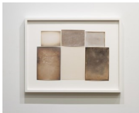
Alison Rossiter (American, b. 1953) Expired 1890s, 1900s, 2023 Six Gelatin Silver Prints Framed: 15 7/8" x 20 5/8" (40.5 x 52.5 cm) Unique (AR.23694)

Two Gelatin Silver Prints Overall: approximately 12 3/4" x 6 1/2" (33.5 x 16.5 cm) Framed: 17 13/16" x 11 7/16" (45 x 29 cm) Unique (AR.25570)