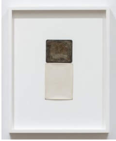
Alison Rossiter (American, b. 1953) Daguerre, Baekeland, 19th century (4), 2024 Daguerreotype Plate and Gelatin Silver Print Overall: approximately 8" x 4" (20 x 10 cm) Framed: 14 15/16" x 11 15/16" (38 x 30 cm) Unique (AR.25577)