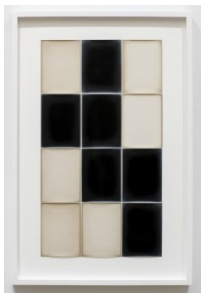
Alison Rossiter (American, b. 1953) Semblance, Man Ray Tapestry, 2025 Twelve Gelatin Silver Prints 4 5/8" x 3 1/2" (12 x 9 cm), each element Framed: 23 3/4" x 15 11/16" (60.5 x 40 cm) Unique (AR.25594)