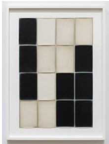
Alison Rossiter (American, b. 1953) Semblance, Man Ray Tapestry, 2025 Sixteen Gelatin Silver Prints 6" x 4" (15 x 10 cm), each element Framed: 28 7/8" x 21 3/8" (73 x 54 cm) Unique (AR.25583)