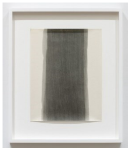
Alison Rossiter (American, b. 1953) Gevaert, Novaflex Contact Paper, ca.1950s, processed 2024 (2), 2024

Gelatin Silver Print 11" x 8 1/2" (28 x 22 cm) Framed: 15 15/16" x 13 7/16" (40 x 34 cm) Unique (AR.25562)