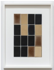
Alison Rossiter (American, b. 1953) Semblance, Man Ray Tapestry (1), 2025 Sixteen Gelatin Silver Prints 2 1/2" x 1 3/4" (6.5 x 4.5 cm), each element Framed: 16 9/16" x 12 9/16" (42 x 32 cm) Unique (AR.25466)