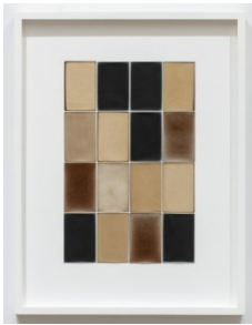
Alison Rossiter (American, b. 1953) Semblance, Man Ray Tapestry (3), 2025 Sixteen Gelatin Silver Prints 2 1/2" x 1 3/4" (6.5 x 4.5 cm), each element Framed: 16 9/16" x 12 9/16" (42 x 32 cm) Unique (AR.25468)