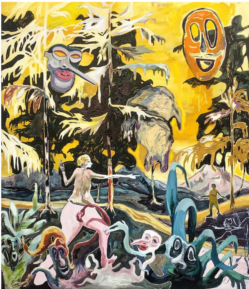
Pierre Knop, Too fool for school (2019).

If you happen to be in either city (or ideally both) we've picked 10 exhibitions that you won't want to miss.